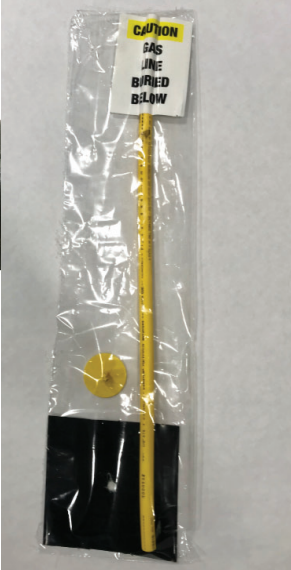
TMST-ST | Steel Application Package