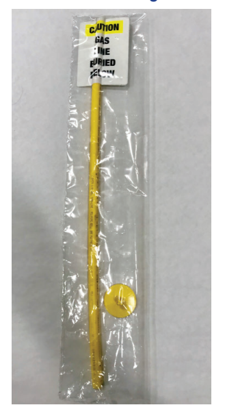
TM01-3M | Base Package