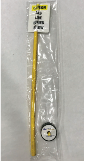
TMTT-PC | Standard Tap Tee Application Package