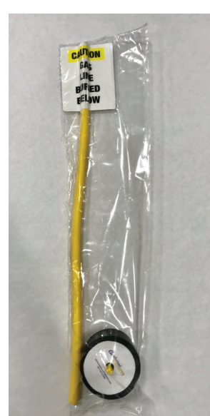
TMHV-C | High Volume Tap Tee Application Package