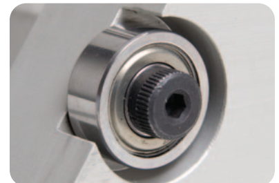
Sealed bearing guide wheels to ensure smooth travel around the pipe. Resistant to grit and moisture that causes seizing, chatter and skipping on other wheels.