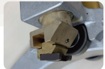
Spring loaded, floating blade carriage handles uneven pipe surfaces with ease.

Introducing the RiteScape family of PE pipe & tubing scrapers. The most versatile electrofusion scrapers available today. Utilizing a unique floating blade system, RiteScape eliminates scrape zone skipping and guide wheel lock up. It even produces a uniform scrape on oval pipe! Why take a chance on missing the mark by using inferior scraping tools? RiteScape offers complete value; strong, consistent, long lasting and is locally stocked and supported.